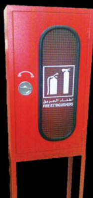
SELF STANDING CABINET WITH GLASS