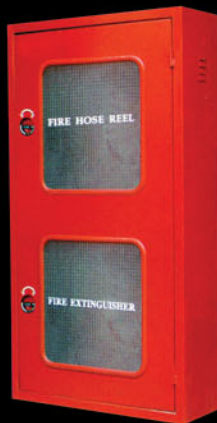
D.DOOR WIRED GLASS CABINET