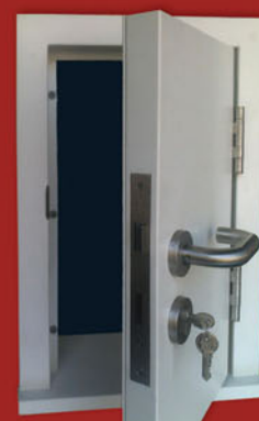
POWDER COATED DOOR