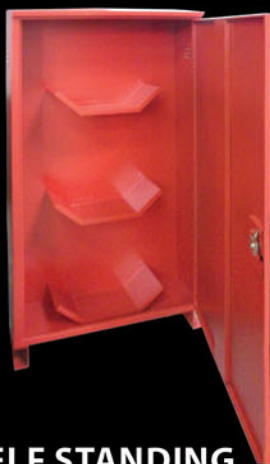
SELF STANDING FIRE HYDRANT CABINET