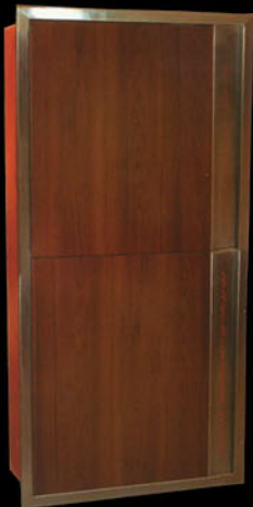
WOODEN LAMINATED DOOR