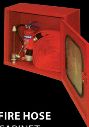
FIRE HOSE CABINET