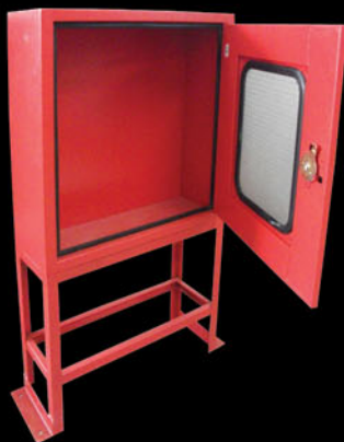
DUST PROOF CABINET