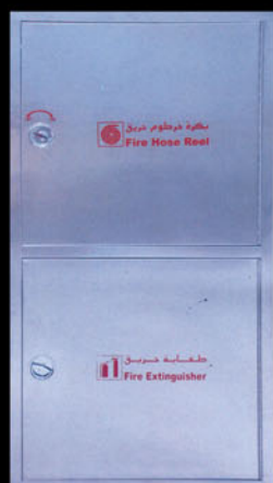
FULL SS SURFACE CABINET