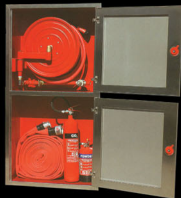
SS. RECESSED CABINET