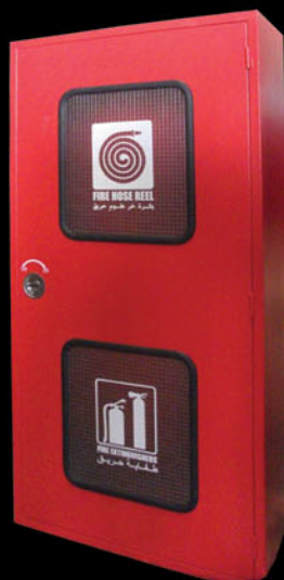
SINGLE WIRED GLASS DOOR