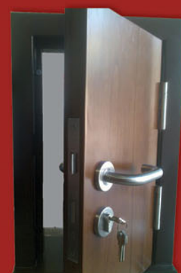
WOOD FINISH DOOR