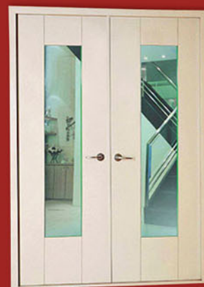
FIRE GLASS DOOR