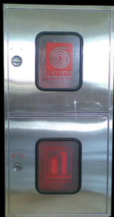
SS GLASS DOOR