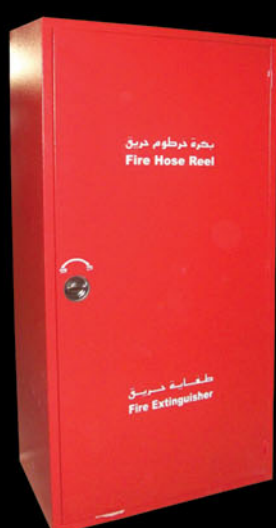
SINGLE SOLID DOOR