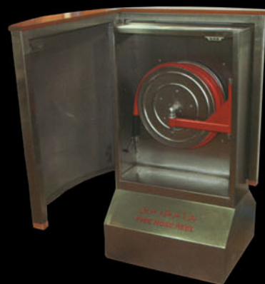
SPECIAL FIRE HOSE REEL CABINET